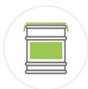
30 Kg DRUM

Please verify the packaging details, including volume and availability, with your sales representative, as they may vary depending on the production facility where the product is manufactured.