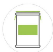
250 Kg DRUM