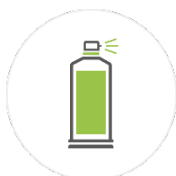
650 ml AEROSOL