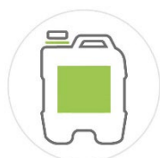
20 Kg CANISTER