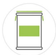
200 Kg DRUM